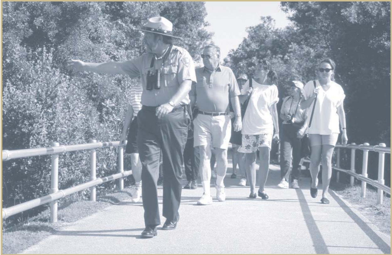
FIGURE 2— This guide is showing a tour group through the Florida Everglades.

Another characteristic of tour operators is that many operate specific ground services and other aspects of the tour at each destination. They may actually employ personnel such as drivers, escorts, and guides. Tour operators might also arrange tours that utilize tour guides at destinations such as national parks, wildlife reserves, and historic preservation sites (Figure 2). They also often own their own motorcoach touring vehicles and in some cases, hotels or other accommodations.