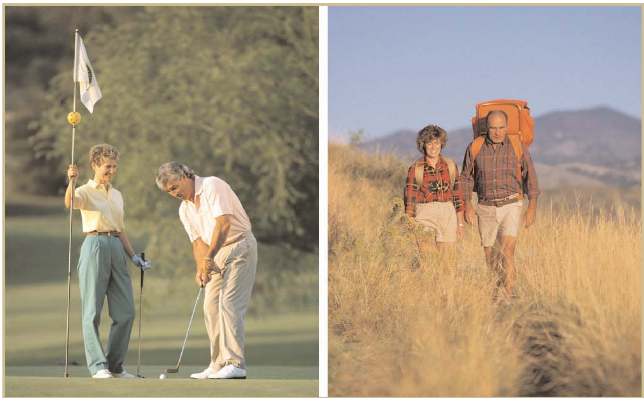
FIGURE 1 —Vacationers want more flexibility while on vacation.

Group tours and vacation packages have varied in type over the years. The shift in touring preferences is largely driven by the baby boomer population. The demands of this generation are changing, as baby boomers want travel that matches their specific needs and interests. They like the idea of adventure and they want to travel in smaller, more concentrated groups. They also want more free time, flexibility, and some independence while travelling (Figure 1).