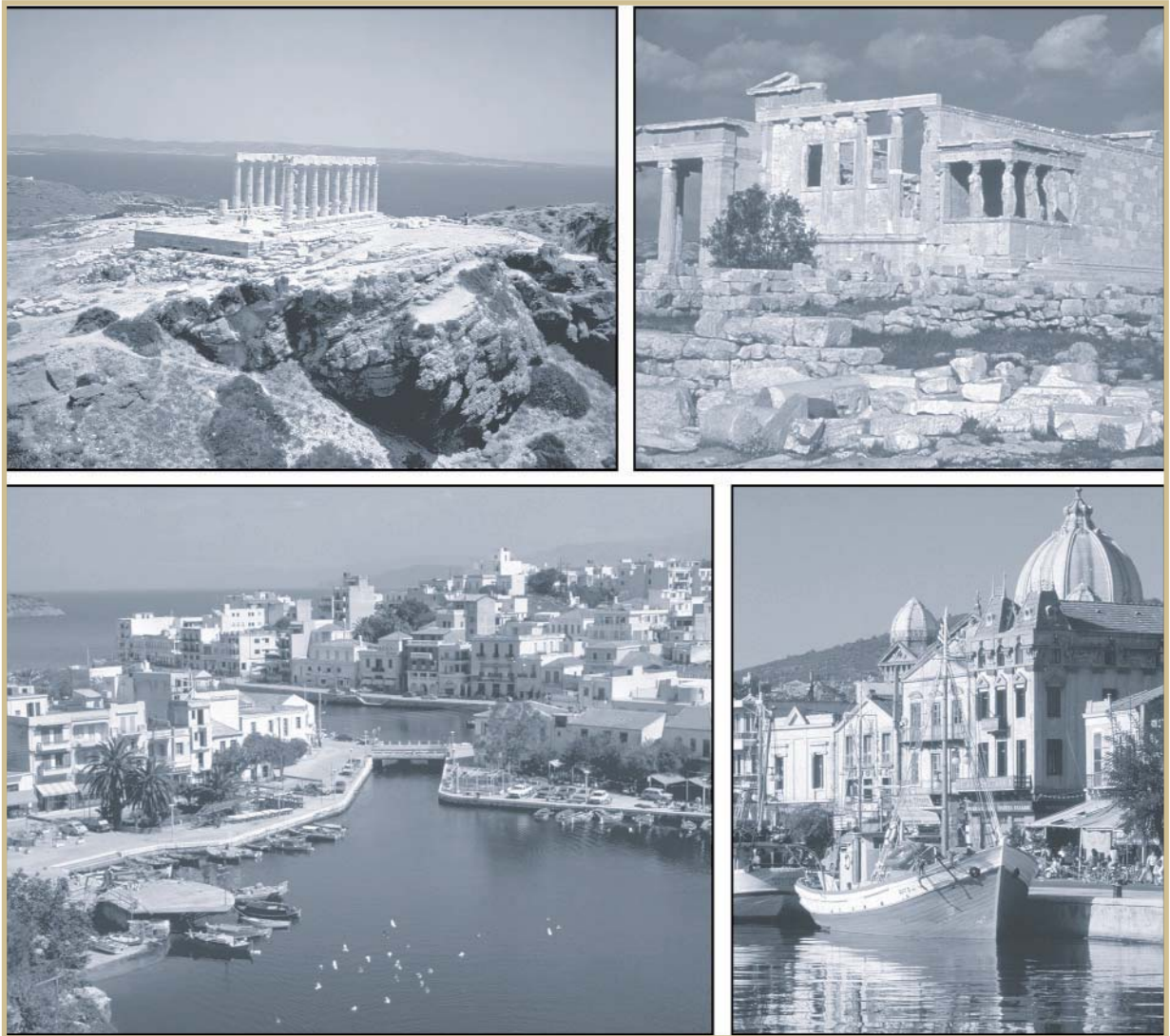
FIGURE 3—A tour of Greece will feature the glistening sunwashed islands as well as visits to the ancient ruins.

Scene 2. Your clients are interested in taking a unique tour through China. Their interests range from visiting beautiful temples, gazing at haunting landscapes through inland China, and taking a Yangtze River cruise (Figure 4). They can't find a published tour that suits them. They don't want to be part of a group but want you, their travel agent, to develop a specialized tour for them. This is called a foreign independent tour or FIT for short. You discuss their interests, what they want to see and do, and where they want to go; you plan a tentative itinerary with them.