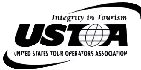
FIGURE 5—USTOA Membership Seal

The USTOA Membership seal (Figure 5) is always displayed prominently in the brochures and other marketing publications of member tour operators. Watch for it when booking tours.